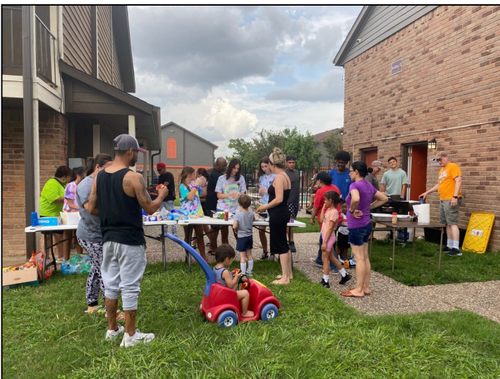
A few pictures from the Hand to Hand Ministry, Mission of Yahweh, and from mission trip in Belize.

Please mark your calendars with the NEWSLETTER DUE DATE: August 23 (for the September 2024 issue)